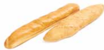
Bread Sticks French Stick, Ciabatta Stick