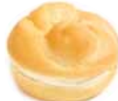
White Knot Roll