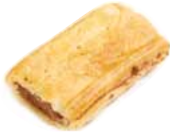
Sausage Roll - Standard