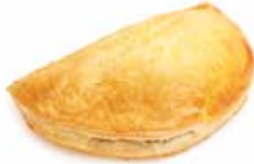
Pasties - Meat & Vegetable, Vegetable or Wholemeal Vegetable