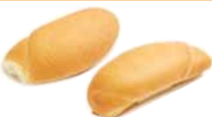
White Fattie or Long Roll