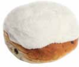
Family Boston Bun