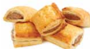
Mini Sausage Rolls