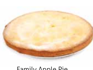
Family Apple Pie