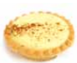
Mini Custard Tart