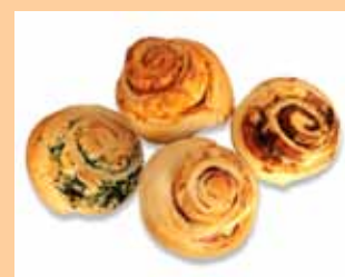
Savoury Scrolls Vegemite & Cheese Tomato & Cheese Cheese & Ham Spinach & Cheese