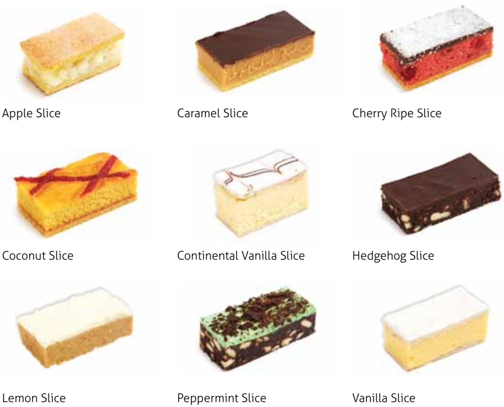
Apple Slice Caramel Slice Cherry Ripe Slice Coconut Slice Continental Vanilla Slice Hedgehog Slice Lemon Slice Peppermint Slice Vanilla Slice