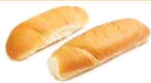
Hot Dog Roll or Super Roll