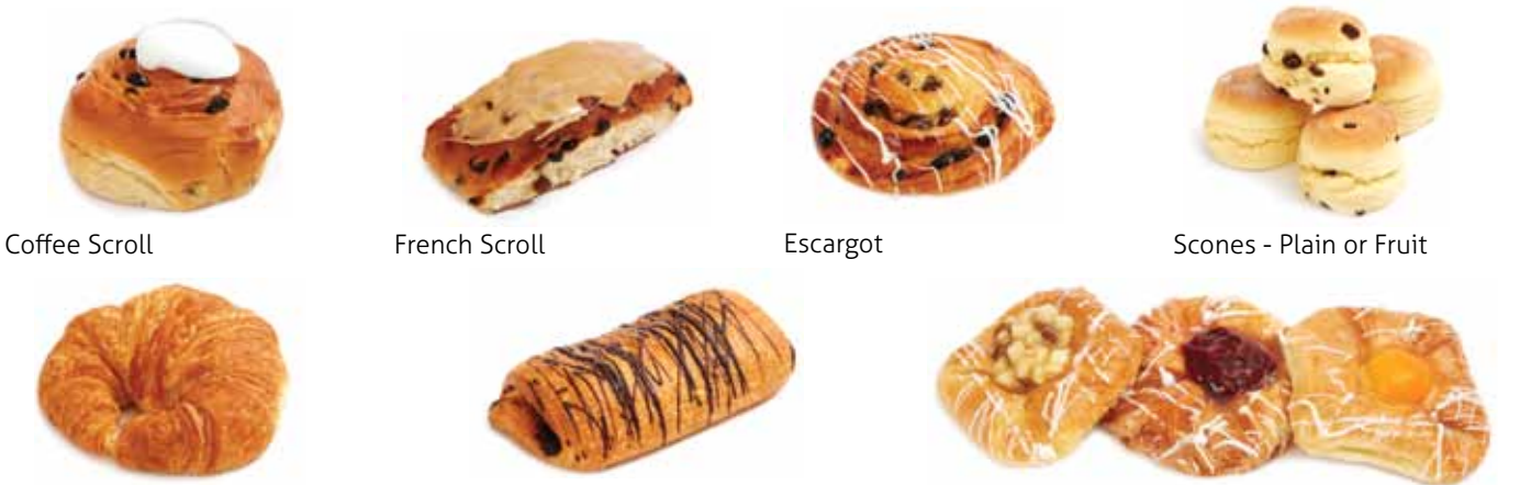
Coffee Scroll French Scroll Escargot Scones - Plain or Fruit Croissant - Large Choc Croissant Fruit Danish