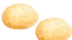
Plain Focaccia Rolls