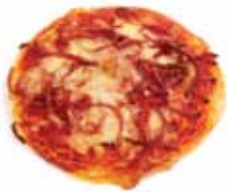
Ham & Cheese