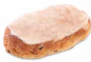
Family Cinnamon Bun