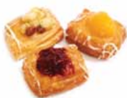
Mini Fruit Danish