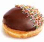
Choc Jam Donut - Sprinkled