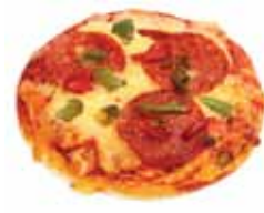
Hot & Spicy