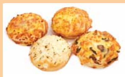
Flavoured Rolls Onion Cheese Cheese & Mushroom Cheese & Bacon