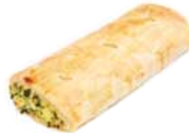
Spinach & Cheese Roll