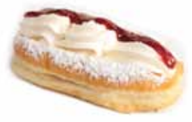
Long Cream Donut