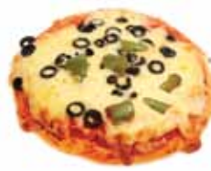
Vegetarian Also available Halal