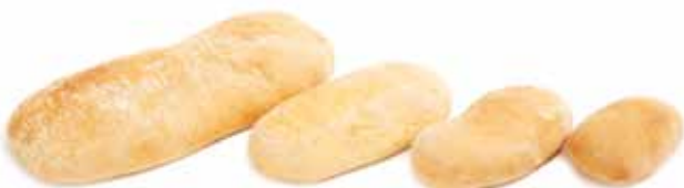
Ciabatta Loaf, Rolls: Long, Medium, Mini