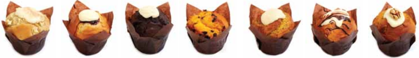
Apple Cinnamon Blueberry Chocolate Jaffa Orange Poppy Raspberry Banana & Walnut