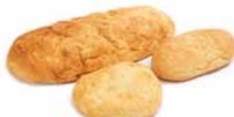
Turkish Bread Loaf, Long Roll, Round Roll