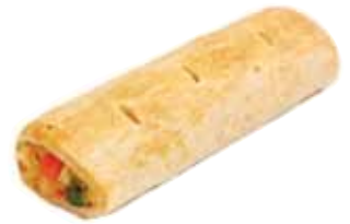
Wholemeal Vegie Roll