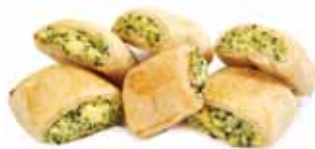
Mini Spinach & Cheese Rolls