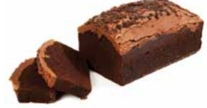
Block Cakes - Chocolate, Banana or Carrot