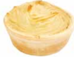
Steak & Potato Pie