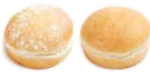
Deep Burger - Flour or Plain