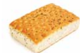
Square Focaccia - Garlic & Herb