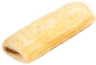
Sausage Roll - Jumbo