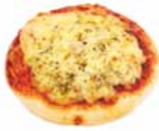
Margherita Also available Halal