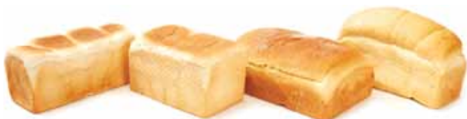
Blocks Available in White, Wholemeal, Multigrain & Rye Square, Fattie, Maxi and Hi Vienna