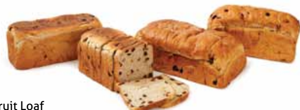
Fruit Loaf Square, Fattie, Maxi and Hi Vienna